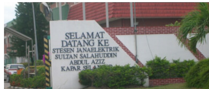
Kapar Energy Ventures – Sultan Sulahaddin Abdul Aziz Power Station, Unit 5